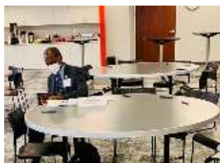
Hampton Mayor, Donnie Tuck